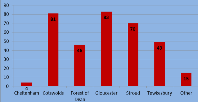
Where do you live?

During this period, Play Gloucestershire were delivering community play in all county districts except Cheltenham. The highest returns were in Gloucester and the Cotswolds; which reflects the amount of community play being delivered here. Most of the 15 people categorised under other were visitors from outside of the county. Some visited from just over the Gloucestershire border and others from as far away as the USA.